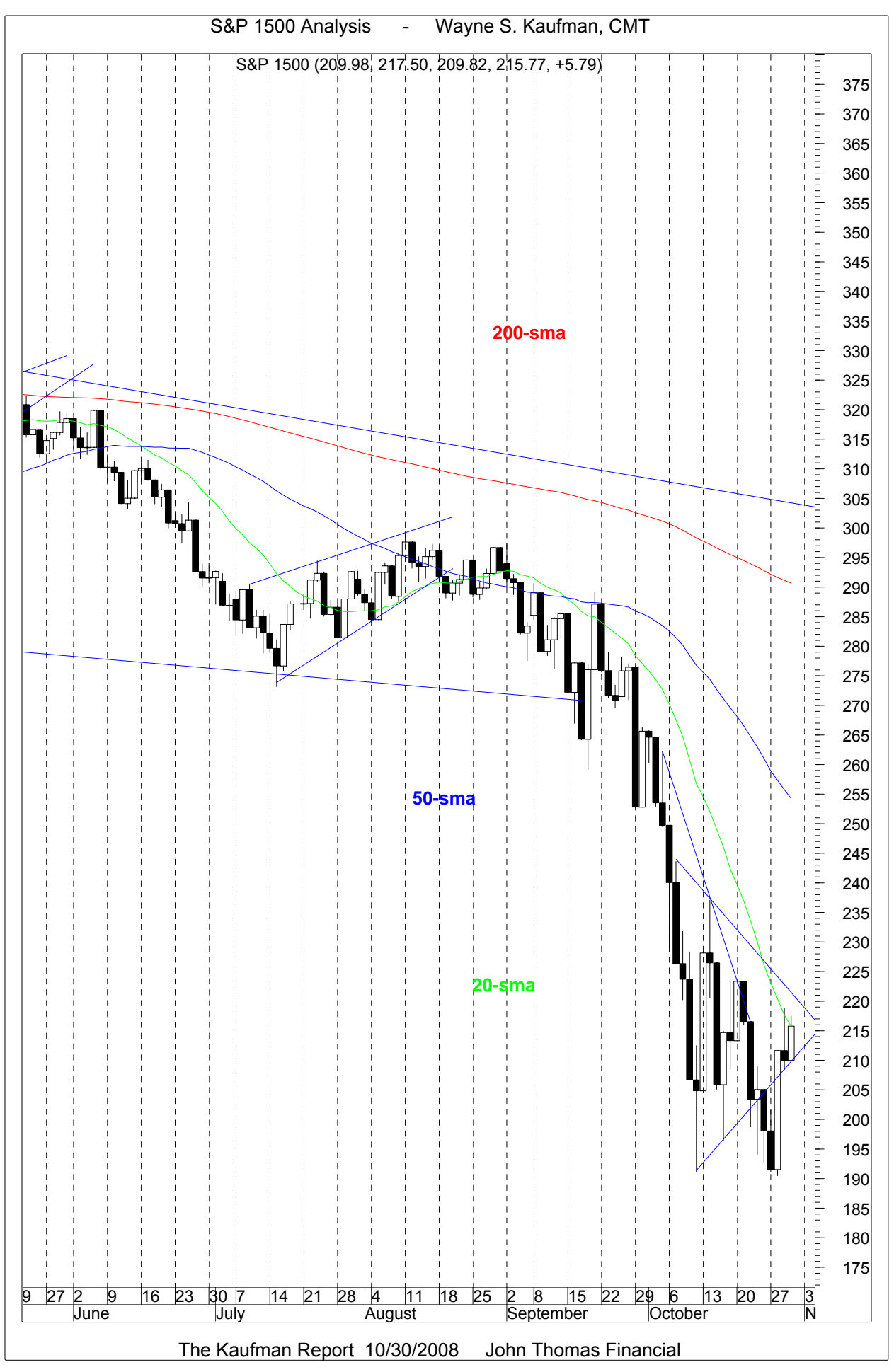
The S&P 1500 rallied Thursday to resistance in the form of the 20-day moving average.